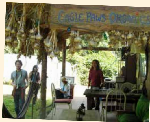
Farm Tour 2013

This well-attended film night at EMCS, featured local farm vendors and food producers selling produce and seeds, and Sooke Food CHI promoting its programs and activities. Following the film, there was a panel discussion with Sooke area women farmers.