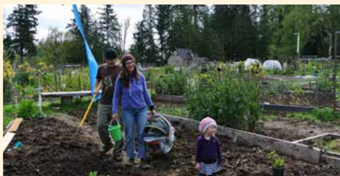
Family gardening at Sunriver Community Gardens