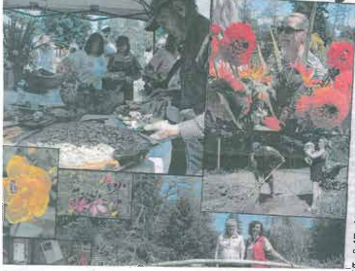
SOOKE NEWS MIRROR - WEDNESDAY, AUGUST 7, 2013