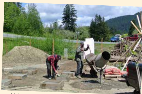
Volunteers pouring foundation for Apple Shack