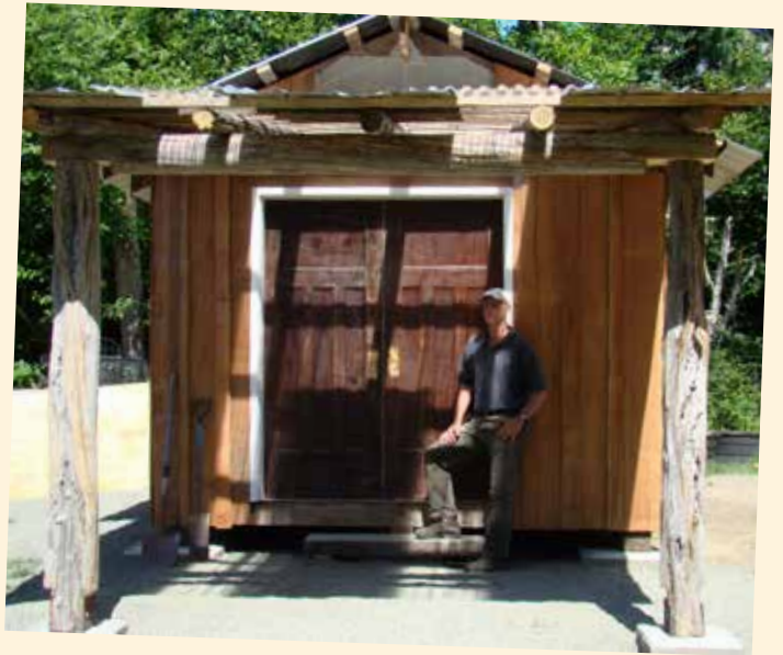
Apple Shack Learning Centre