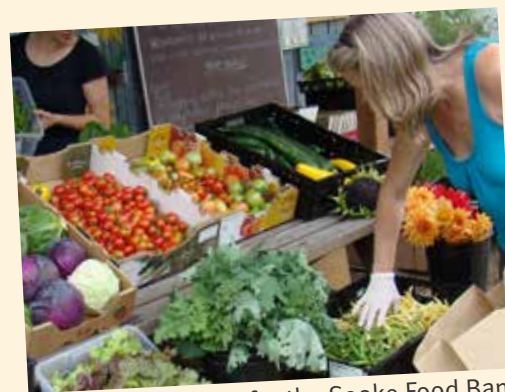
Harvesting for the Sooke Food Bank