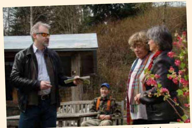
EPCOR cheque presentation March 2013

Cover photo: Volunteers creating new plots at Sunriver Community Gardens